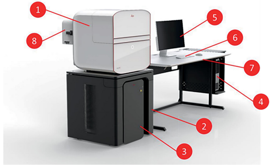
Figure 1: Microhub with inverted imager, incubator, and the flexible supply unit under the anti-vibration table. Small computer table.

*Work table: min. 90 cm x 80 cm (min. 35.4" x 31.4")