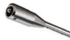
DS-500/5 Cat No.18900117

Emulsion Volume 10-5000mL Max. circum. Speed 23.5m/sec General emulsion purpose Emulsion granularity range 1-10 \mu m Suspension granularity range 10-50 \mu m