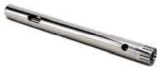
DS-500/2 Cat No.18201332

Solid and liquid dispersion Volume 10-5000mL Max. circum. Speed 23.5m/sec General purpose Emulsion granularity range 1-10 \mu m Suspension granularity range 10-50 \mu m