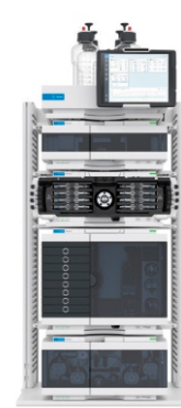
Agilent Benchtop (5043-1740*) 🔦 (Top Recommendation)

*with power strip, available in regions except Asia Pacific. For Asia Pacific please use part numbers for benches without power strip: 5043-1252, G6015A, 5043-1711 from left to right