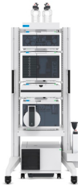
Agilent FlexBench MS (G6015B*) for Agilent Ultivo Triple Quadrupole LC/MS and InfinityLab LC/MSD