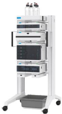
Agilent FlexBench (5043-1759*) 🔦 (Top Recommendation)