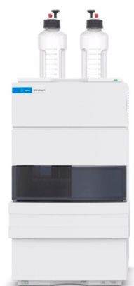
1220 Infinity II LC Workflow