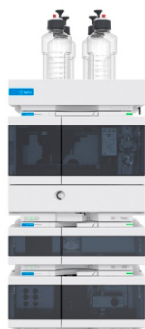
1260 Infinity II Prime LC Workflow