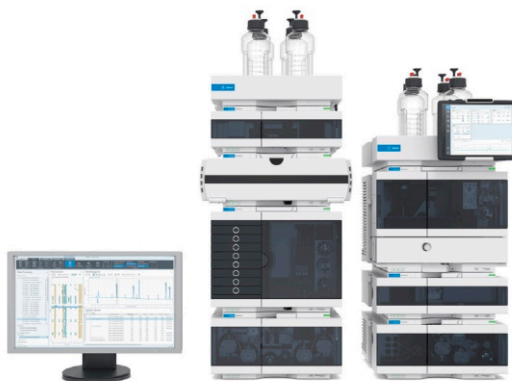
1290 Infinity II LC Workflow