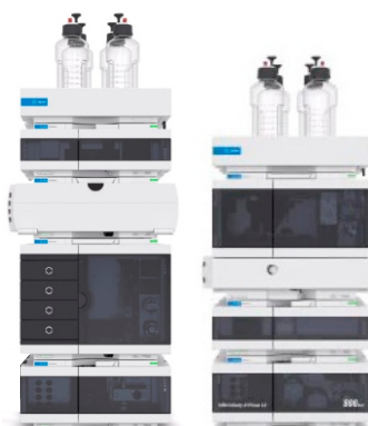
1260 Infinity II LC Workflow