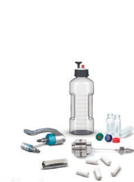
InfinityLab Starter Kit (Partial)