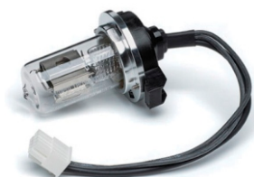
InfinityLab Long-life HiS Deuterium Lamp