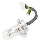
InfinityLab Long-life Deuterium Lamp