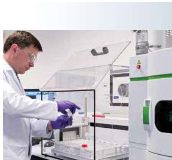
Atomic Emission Spectroscopy Analysis

With Honeywell's analytical reagents, superior quality and safety standards are a prime focus. We use a comprehensive Quality Assurance System in line with EN 29001 (ISO 9001) and each of our products is manufactured to clear, guaranteed specifications. We employ a large variety of modern analytical methods, such as inductively coupled plasma atomic emission spectroscopy (ICP-OES), inductively coupled plasma mass spectrometry (ICP-MS), flame atomic absorption spectroscopy (AAS) and graphite furnace AAS. This allows for specifically tailored control and analysis procedures for each product.