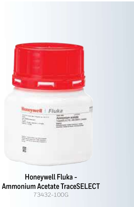
Honeywell Fluka - Ammonium Acetate TraceSELECT 73432-100G

For more information, visit: lab-honeywell.com/traceselect