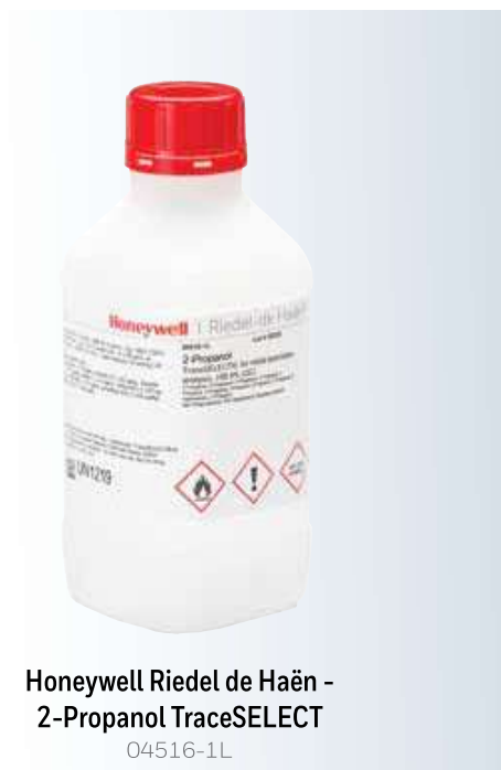
Honeywell Riedel de Haën - 2-Propanol TraceSELECT 04516-1L

Performing a speciation analysis in a complex mixture involves separation, identification, and characterization of various forms of elements in the sample. The most commonly used strategy for speciation analysis is to perform a separation step before a generic detector.