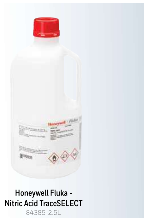
Honeywell Fluka - Nitric Acid TraceSELECT 84385-2.5L

The reduction of metals into mercury is more favourable than reduction to the solid-state electrode. Further on there is always a clean new Hg electrode surface available for each measurement.